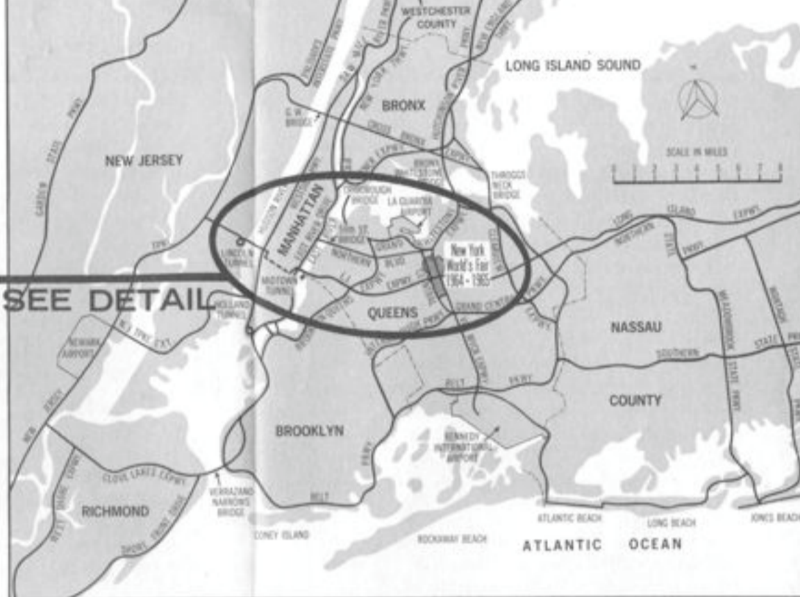
The New York World's Fair is located at the geographic and population center of the greater New York metropolitan area.