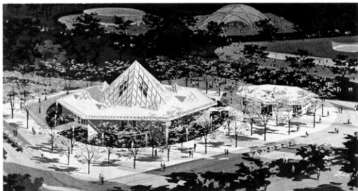
Architect's drawing of Christian Science Pavilion: Main Exhibit Building (left) and Reading Room (right).

The Exhibit Building and Reading Room (pictured at right) will be set in a small forest when landscaping plans are completed. Adjacent to the Reading Room will be a French park, with individual chairs in shaded areas where visitors may read or sit quietly. A publications area will be established in the Exhibit Building... apart from the quietness of the Reading Room... where The Bible , The Christian Science Monitor , and all authorized Christian Science literature may be obtained. In this building, also, Christian Science will be unfolded through graphic displays, pictures, film and telephonic devices.