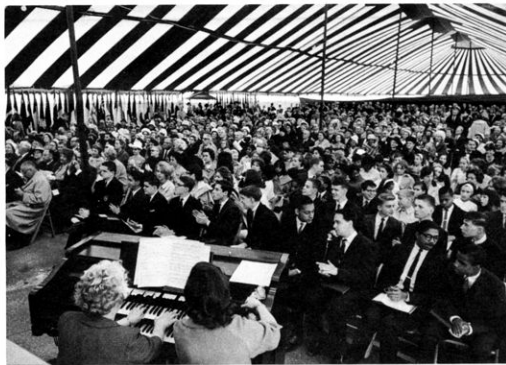
Happy throng at groundbreaking ceremony in candy-striped (mint green) tent.

"Now unto him that is able to do exceeding abundantly above all that we ask or think, according to the power that worketh in us, unto him be glory in the church by Christ Jesus throughout all ages, world without end. Amen" (EPHESIANS 3: 20, 21).