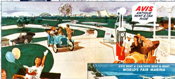
AVIS RENT A CAR/AVIS RENT A BOAT WORLD'S FAIR MARINA

your guide to New York and the World's Fair 1964-1965