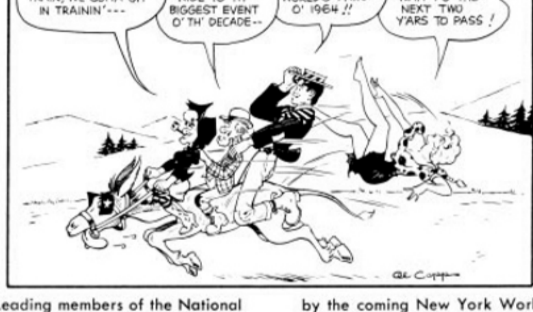
by the coming New York World's Fair, including drawings by Walt Kelly, Al Capp and Milton Caniff, to open their drawing pads and "foresee" what the Fair might be like for the projected 70 million visitors from all parts of the world.