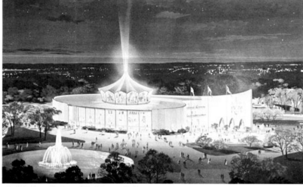
Architect's rendering of the Vatican Pavilion, to be erected at the New York World's Fair. Surmounted by a lantern and a cross, it will rise to a total height of 100 feet and measure 208 feet long and 135 feet wide.