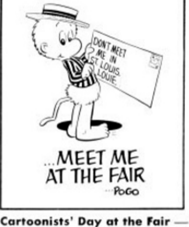
Cartoonists' Day at the Fair — Leading members of the National Cartoonists Society covering the Eastern Seaboard visit the Fair today for a briefing co-hosted by Milton Caniff, past president of the Society and creator of the famed "Steve Canyon" cartoon strip for the Chicago Sun Times Syndicate. With many cartoons already inspired