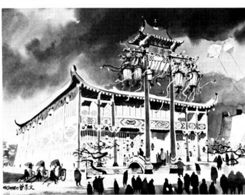
The proposed Hong Kong Pavilion, as drawn by Dong Kingman, and sponsored by a group of the British Crown Colony's businessmen, typifies a native teahouse.

Mr. DeWitt told newsmen, after the groundbreaking ceremonies, that Travelers plans to promote the Fair in all sections of the United States and Canada through its 21,000 salaried employees and 50,000 agents and representatives. ●