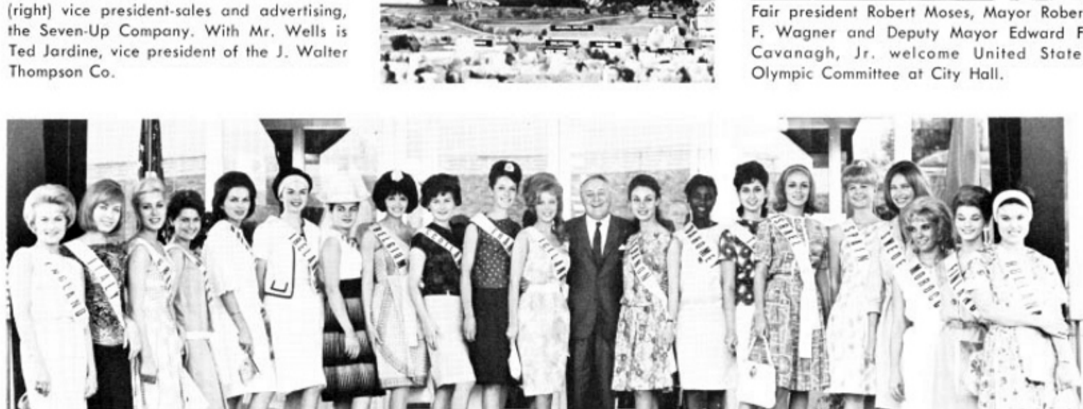
Miss Universe contestants from many of the countries of the world pay a visit to the Fair's Administration Building before leaving for their final competition in Miami beginning July 6. Governor Charles Poletti greeted the girls on their arrival.