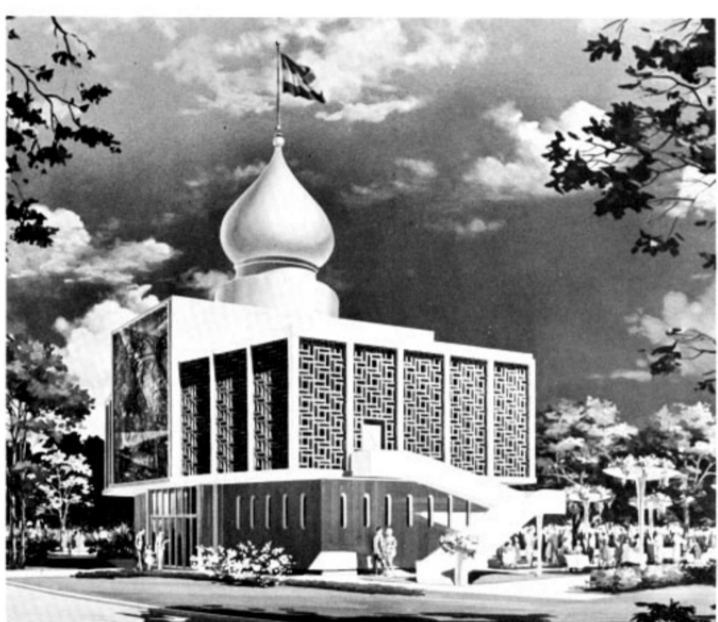
Rendering of proposed pavilion for the Republic of the Sudan. Architects, Noel and Miller.